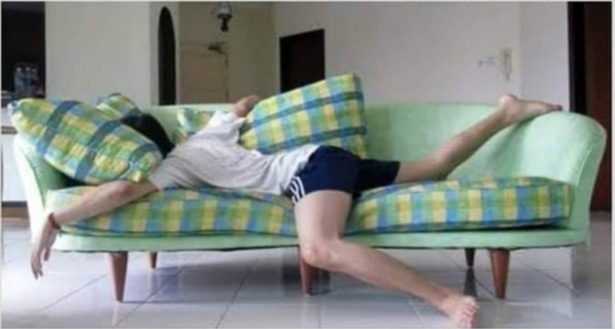
Image 4: The different ways of saving the country, in 1947 and in 2020.