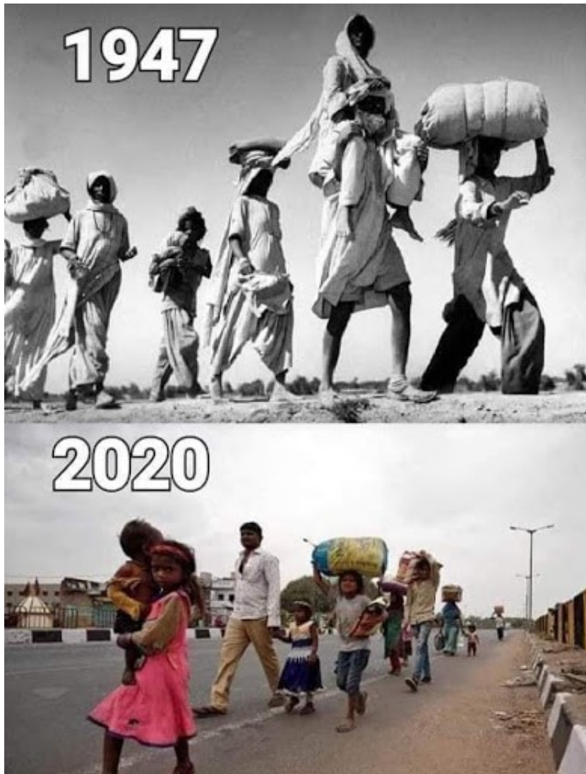
Image 9: This is a juxtaposition of two images. The one on top is from the partition of India in 1947. The one below is of workers trying to reach home, after the 21 day lock down was announced.