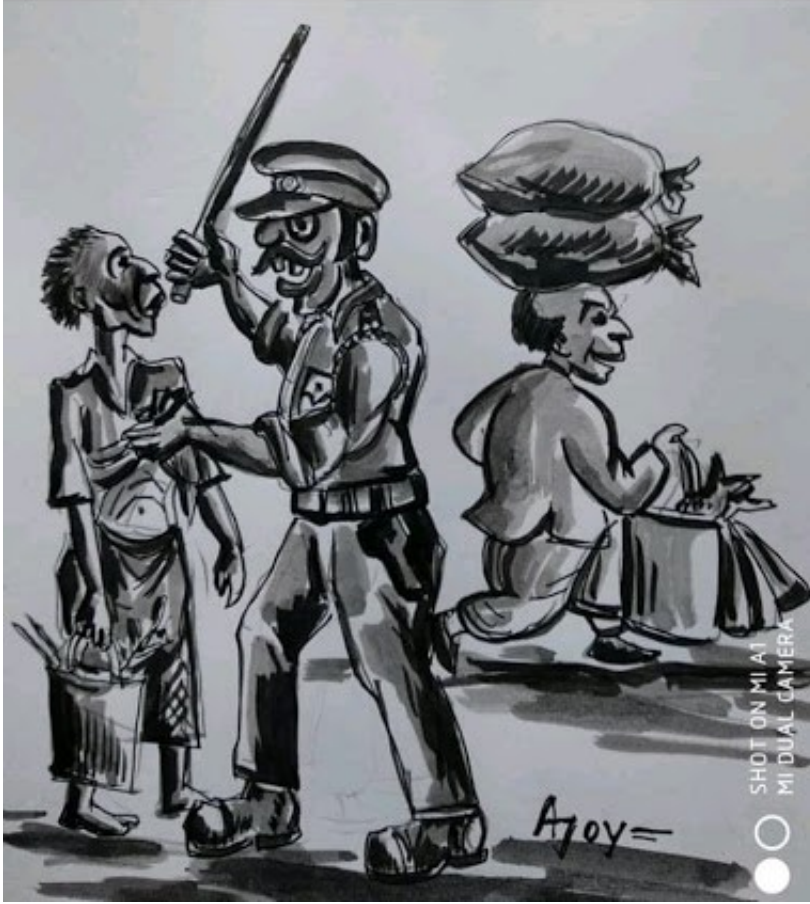
Image 8: The Bangla legend reads ‘Police, you are a brave man, beating up the poor whenever you see them. You salute the rich a thousand times...’ The hand drawn images shows a policeman in uniform about to hit a poor man with a grocery bag, while a well dressed man with a sacks full of food leave unnoticed.