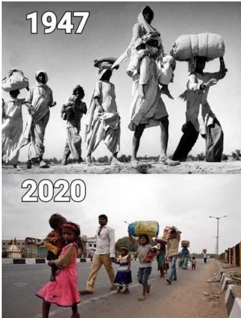
Image 9: This is a juxtaposition of two images. The one on top is from the partition of India in 1947. The one below is of workers trying to reach home, after the 21 day lock down was announced.