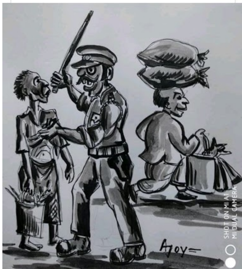
Image 8: The Bangla legend reads ‘Police, you are a brave man, beating up the poor whenever you see them. You salute the rich a thousand times...’ The hand drawn images shows a policeman in uniform about to hit a poor man with a grocery bag, while a well dressed man with a sacks full of food leave unnoticed.