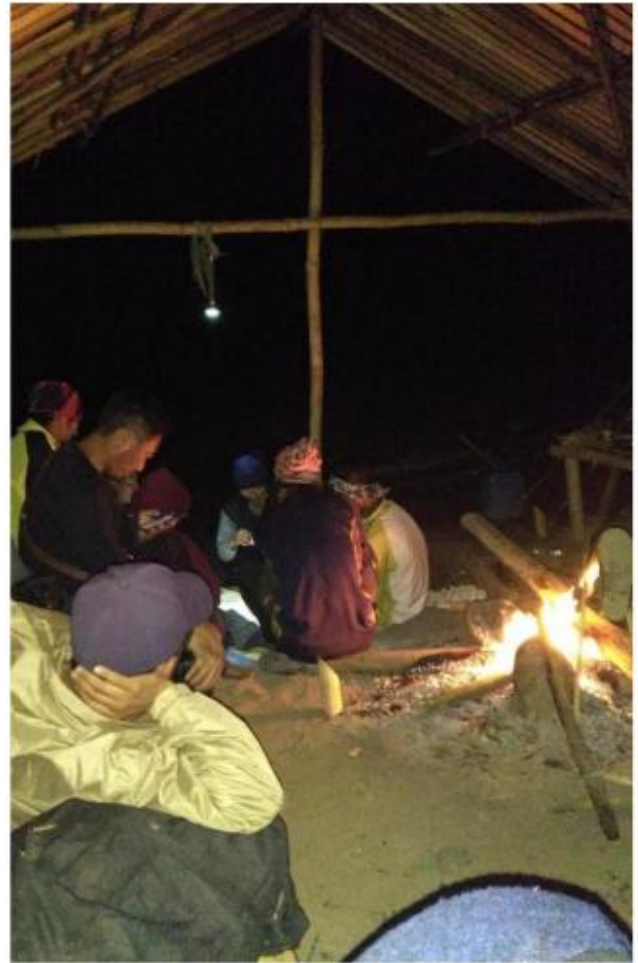
Figure 4 and 5: Youngsters watch over the Assam-Nagaland border to prevent illegal traffic during the lockdown.

Keeping in mind the precarious situation of my students, I have largely resorted to collecting and sending notes, making presentations, and sharing these materials over a Google Classroom group (a practice which thankfully my students have been familiarized with over the past year). These notes are rather rudimentary and prevent me from going on the many digressions and discussions which make classes far more interactive and informative. I hope to send a few audio recordings as podcasts, but downloading or listening to these might again be difficult for students.