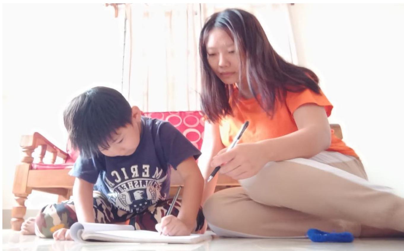
Figure 2: A student teaches her nephew during the COVID-19 lockdown in Dimapur, Nagaland.

rather return to). Most of my students – especially women – from other districts have a whole set of other household responsibilities entrusted upon them the moment they reach home. Many of them are the eldest amongst five or six siblings. The photographs that my students sent to me or shared over social media show that they are spending time now working in fields, catching fish, cooking, feeding, and taking care of children, taking up the responsibility of care in a large household (Figure 2, 3). [4] Besides, many of them live in houses with two rooms separated by a bamboo weave. How can students, in this context, be expected to spend two or three hours in inviolable privacy to attend the online classes which a teacher is supposed to conduct every day?