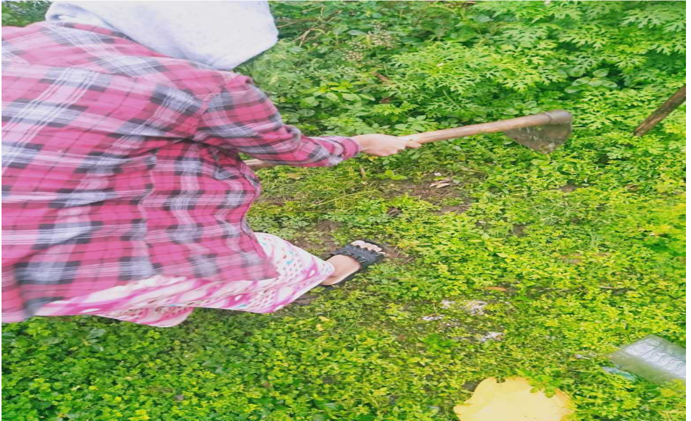
Figure 3: A student at work gardening during the COVID-19 lockdown in Dimapur, Nagaland.

Recently, when I called a student to find out why he was late in submitting an assignment, I found out that a few of them have signed up as volunteers guarding the porous boundaries of their districts to prevent illicit traffic of outsiders who might bring the virus closer to home (Figure 4, 5). They have been sleeping in open sheds, and having food and changing at the local police station. They have not been home for over any considerable duration of time during the past three weeks.