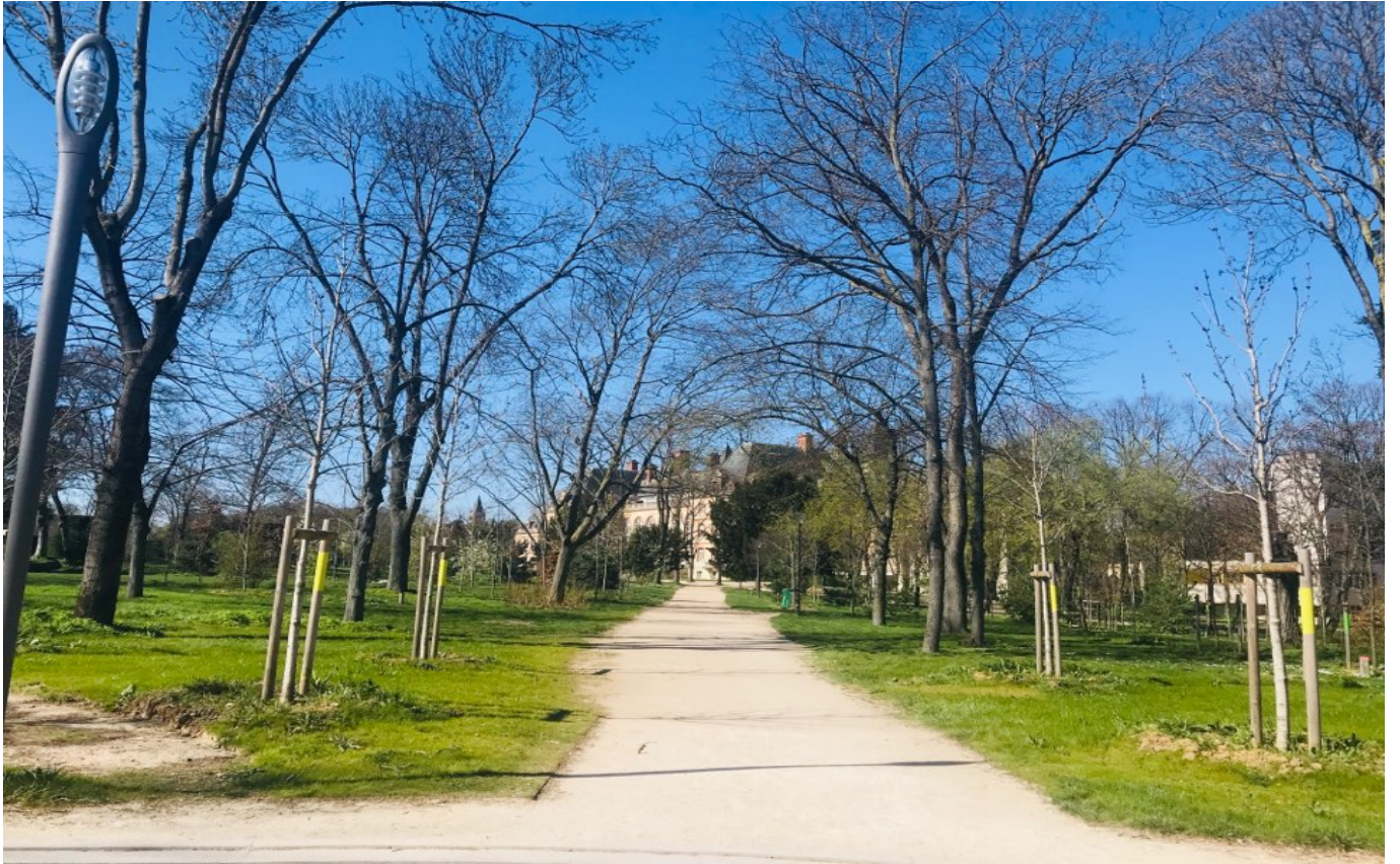
The empty park of Cité Université de Paris. 2020.