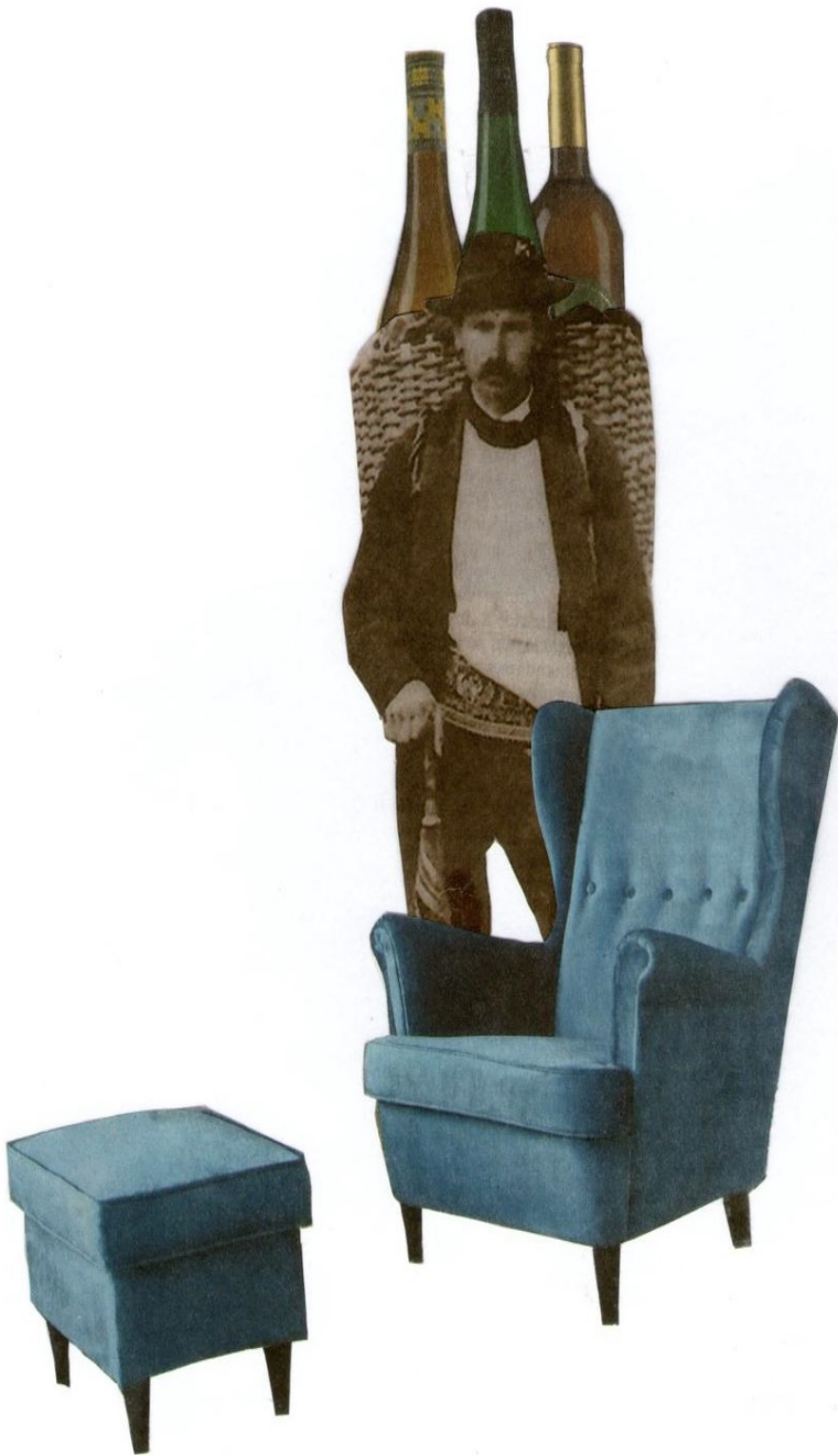
Collage 3: 'Home Sweet Home?'.