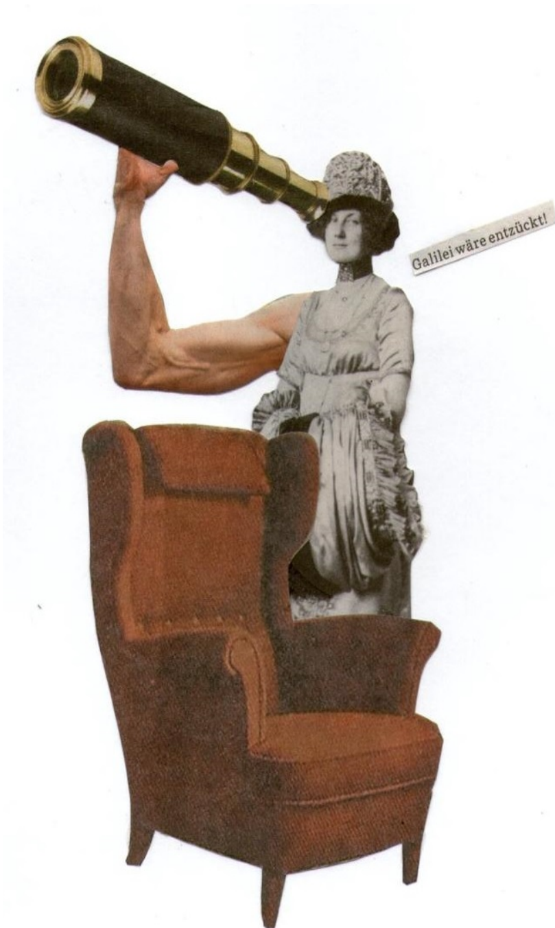
Collage 1: 'Galilei would be delighted'.

students who were already structurally disadvantaged before the pandemic. The challenge – and at the same time required outcome – both manifest in a simple picture: a calm, secure(d) work space where we can think and progress without worrying about technical difficulties, former hierarchies, lost opportunities or how to finance our life.